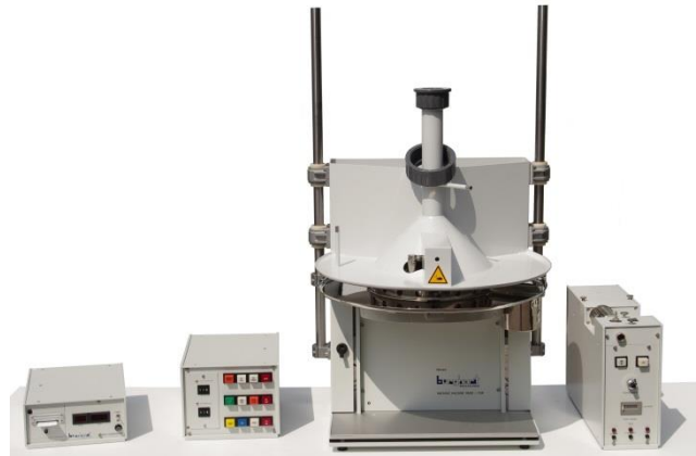
RM20/CSR (with hood) after rebuild

The smoking machine RM20/CS, the pneumatic unit incl. Canada Intense, the RGA-System and Puff Counter Printer are still an integral part of daily cigarette analysis in many smoking laboratories worldwide. In order to ensure the continued availability and smooth operation, we offer a rebuild service for the RM20/CS and the corresponding components. This rebuild service includes: